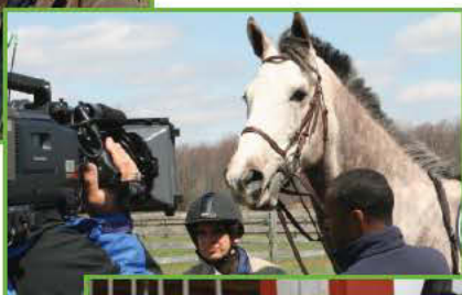
Outer Drive , graduate of TFH, shows off for HBO (right)