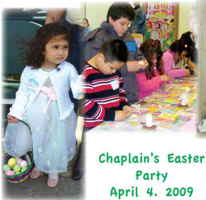
Chaplain's Easter Party April 4, 2009