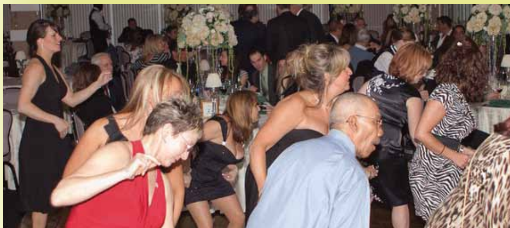
The banquet crowd of over 325 enjoyed an evening of good food, good friends, and dancing!