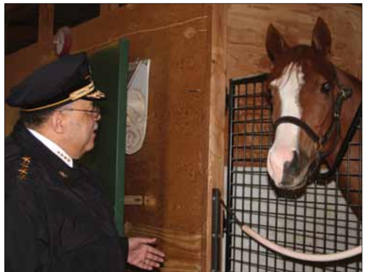
City of Philadelphia's Police Commissioner Charles H. Ramsey visits with one of Parx' horses while on tour of the new barns on the backstretch. The PTHA is looking forward to providing assistance towards the return of Philadelphia's Mounted Unit.