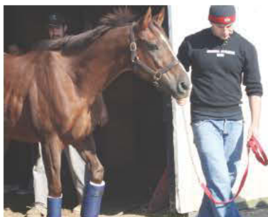
El Frio leaves the racetrack for Special Equestrians. He raced 115 times at Philadelphia Park before he was injured.