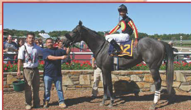
AZADI BROKE HER MAIDEN IN HER SECOND TRY IN THE BRUSHWOOD STABLE MAIDEN SPECIAL ON OWNER'S APPRECIATION DAY FOR MOJALLALI STABLE.