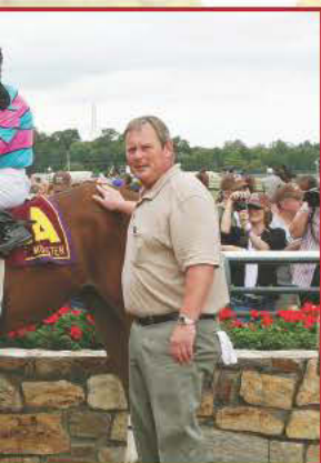
EMBERLAIN BRIDGE , WON INDICAP ON PA DERBY DAY. 5-YEAR-OLD WAR CHANT ELAZQUEZ.