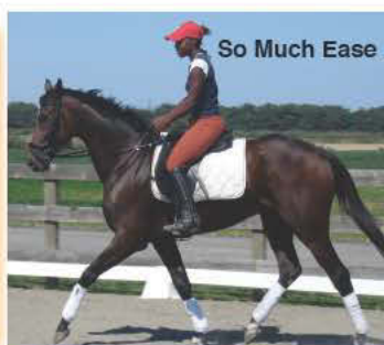
So Much Ease