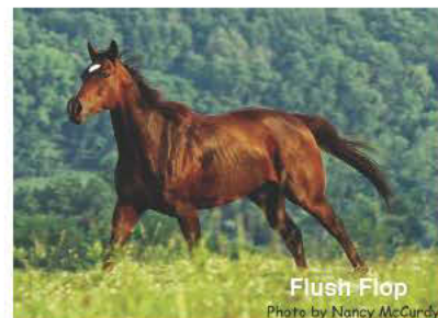
Flush Flop