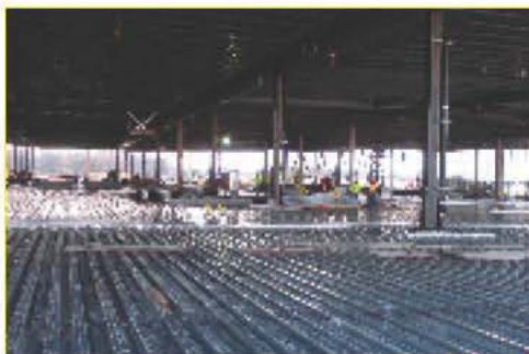
Over 1,700 tons of structural steel have been used to build the 270,000 square foot casino.

"All of our planning has been aimed toward creating something special," said William Hogwood, CEO of Greenwood Racing. "The casino will be able to