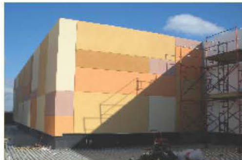
The facade of the new casino features the warm colors and design-style of 19th century artist, Piet Mondrian.

in Atlantic City. "As we stand right now, Philadelphia Park Casino is one of the most successful around," said Hogwood. "We are competing with a mature market and experienced operators, and we are doing it successfully, in spite of the economy."